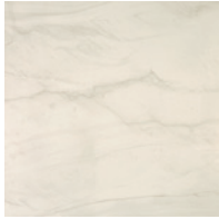
Mont Blanc | V2

48x48 NAT RECT | #29856E 48x48 POL RECT | #29681E 36x72 NAT RECT | #200254E 36x72 POL RECT | #200188E