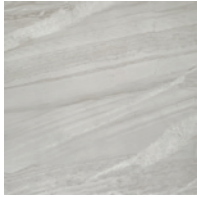
Atlantico | V2

12x12 NAT TEL | #79699ET 12x12 POL TEL | #79698ET