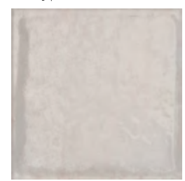
5.7x5.7 GLOSSY PRESSED #202708E