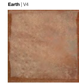
5.7x5.7 GLOSSY PRESSED #202812E